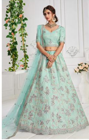
NO — 1017