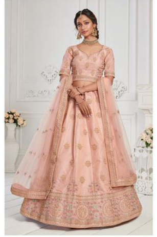
NO — 1019