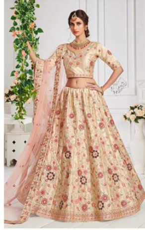
NO — 1018