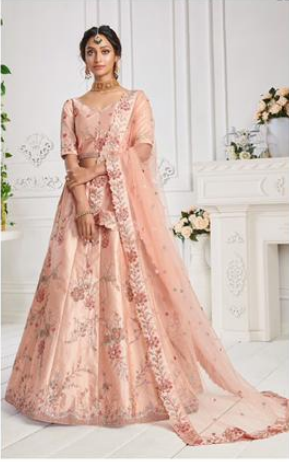
NO — 1016