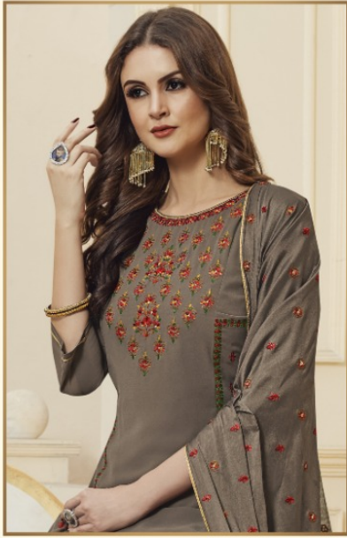
Get dazzled with vivacious colors of India and bring out the ethnic side of you with this beautifully crafted piece.