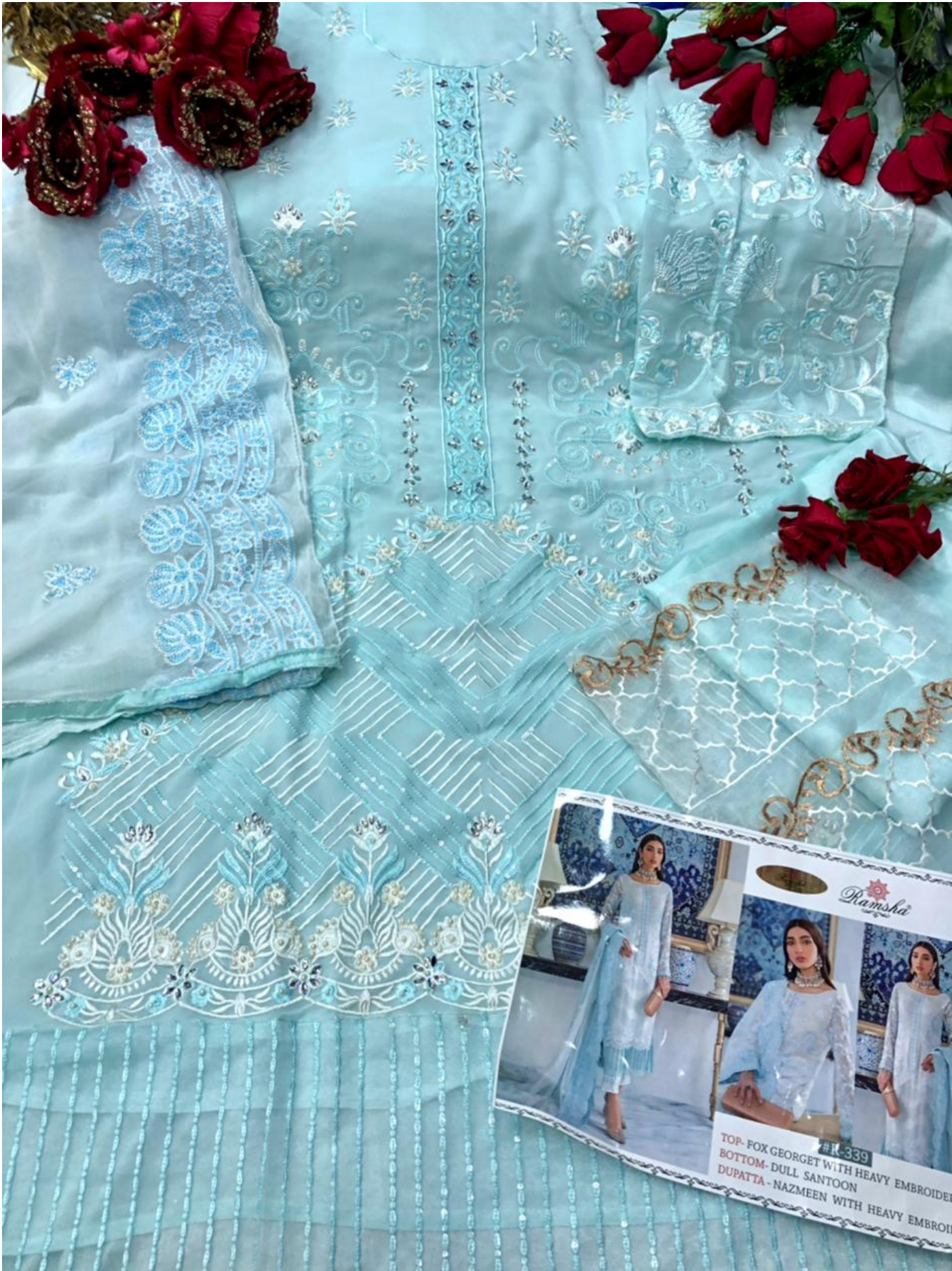
Ramsha #R-339 TOP- FOX GEORGET WITH HEAVY EMBROIDER BOTTOM- DULL SANTOON DUPATTA - NAZMEEN WITH HEAVY EMBROID