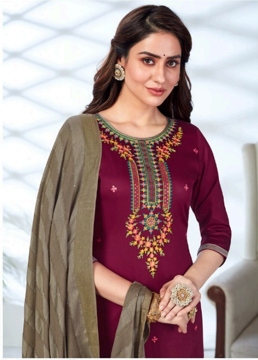
-3111- I hope this moment will last forever