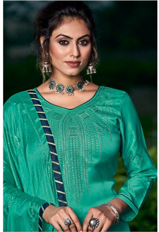
LUXE FABRICS. BOLD PATTERNS & SUMPTUOUS DETAILING ADORN MODERN SILHOUETTES.