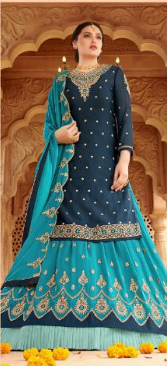
D. NO - 1008