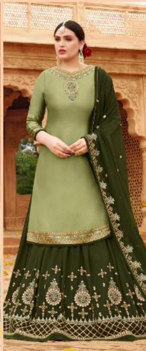
D. NO - 1009