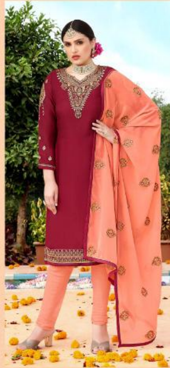
D. NO - 1010