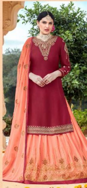
D. NO - 1010