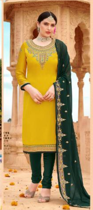
D. NO - 1011