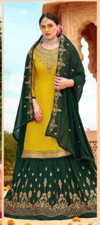
D. NO - 1011