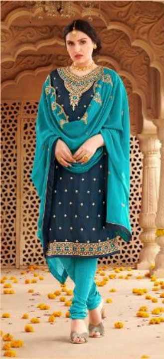
D. NO - 1008