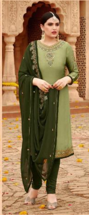
D. NO - 1009