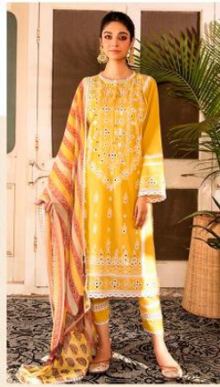
DESIGN | 1142