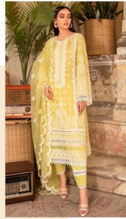
DESIGN | 1146