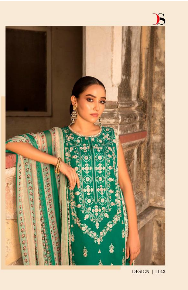
DESIGN | 1143