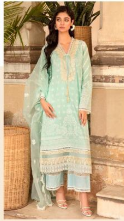
DESIGN | 1145