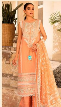
DESIGN | 1144