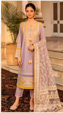
DESIGN | 1141