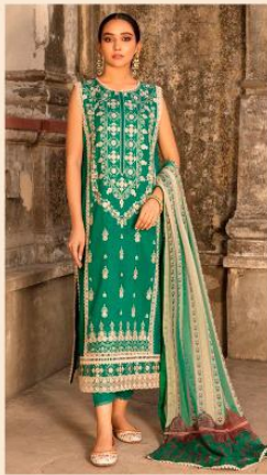
DESIGN | 1143