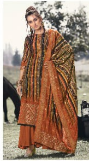
• 257 •