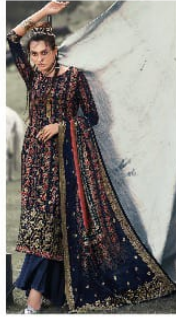
• 254 •