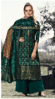
• 256 •