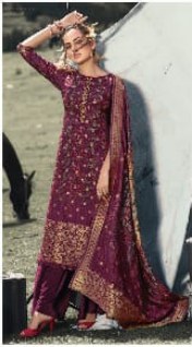
• 255 •