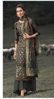
• 258 •