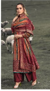
• 253 •