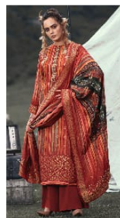
• 259 •