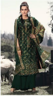
• 252 •