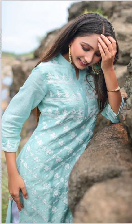
SHQV01 Sea Green - Dyed in a calming hue with embroidery, perfect for everyday wear.