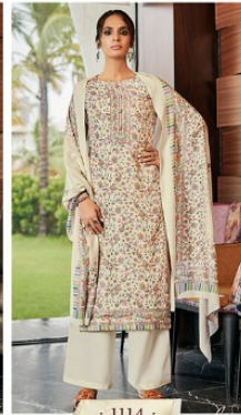
: 1114 :