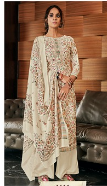
: 1111 :