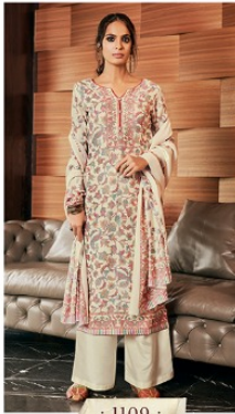
: 1109 :