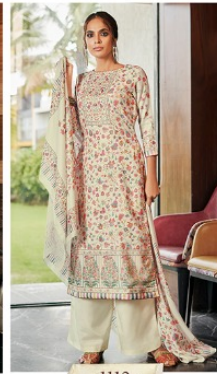
: 1112 :