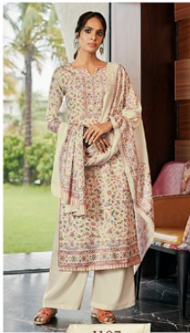
: 1107 :