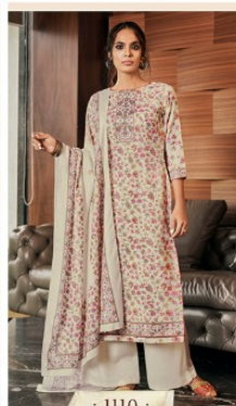
: 1110 :