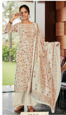
: 1108 :