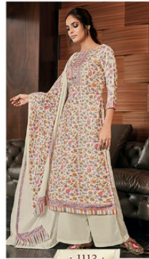
: 1113 :