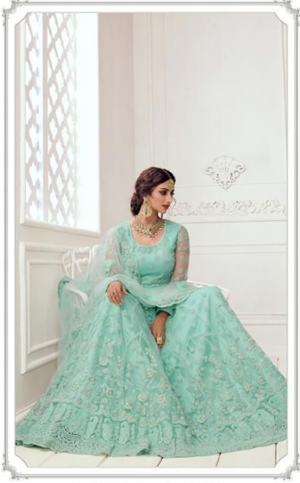
Wearing this lehnga, showcase elegance in its best form 1005-B