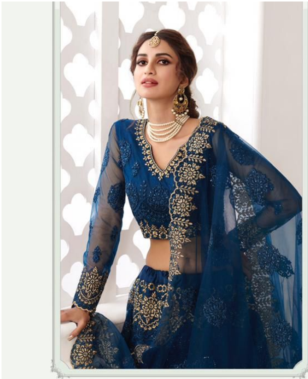
Immerse yourself in unexpected, bright colors & Textures 1007-B