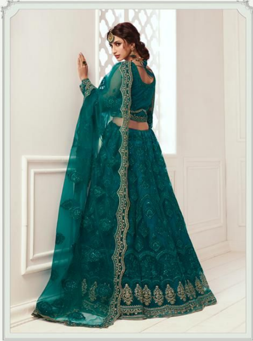
The most interesting fashion trends 1008-C